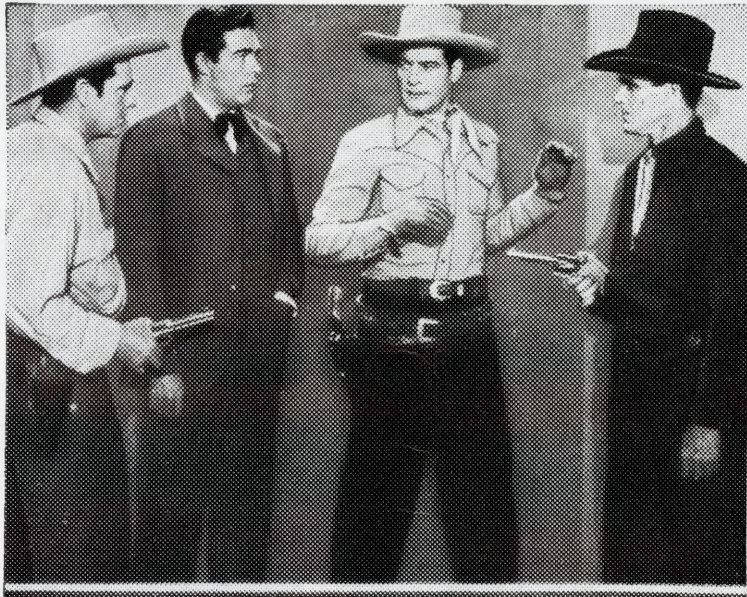
GALLOPING THUNDER Mat 2-A

Charles Starrett, as the Durango Kid, finds himself in a jam as a group of badmen level their guns in a thrilling scene from the Columbia Pictures' Western, "Galloping Thunder," now at the ..... Theatre.